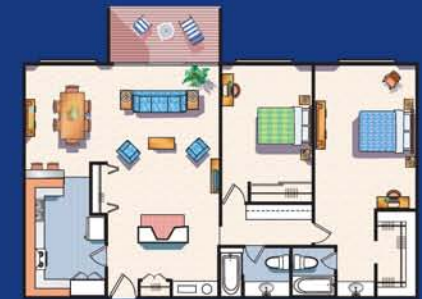
DRESDEN 2 BEDROOM • 2 BATH • 1345 S.F.