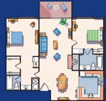
COPENHAGEN II 2 BEDROOM • 2 BATH • 1135 S.F.