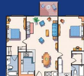
GLASGOW 2 BEDROOM • 2 BATH • 1035 S.F.