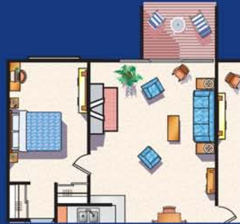
COPENHAGEN I 1 BEDROOM • 2 BATH SEPARATE DEN • 1135 S.F.