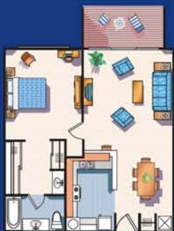
EDINBURGH 1 BEDROOM • 1 BATH • 760 S.F.