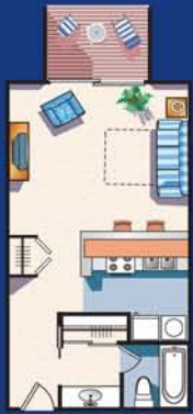
AMSTERDAM STUDIO • 450 S.F.