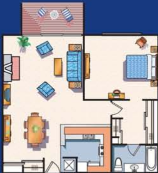
BRUSSELS 1 BEDROOM • 1 BATH • 900 S.F.